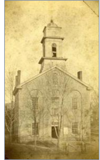
The third courthouse (1838-1883).

By the approval of voters, the juvenile court can be placed under the jurisdiction of an independent juvenile court, or as a division of either the common pleas, probate or domestic relations courts. In Union County, the juvenile court has been under the jurisdiction of the probate court judge since the juvenile court was established in 1906. Each was a separate court until the juvenile court was combined with the probate court pursuant to an act passed on April 29, 1937, which reorganized and recodified the existing juvenile laws. With the passage of the Modern Courts Amendment to the Ohio Constitution in May 1968, Ohio's Probate Courts became divisions of the Courts of Common Pleas.