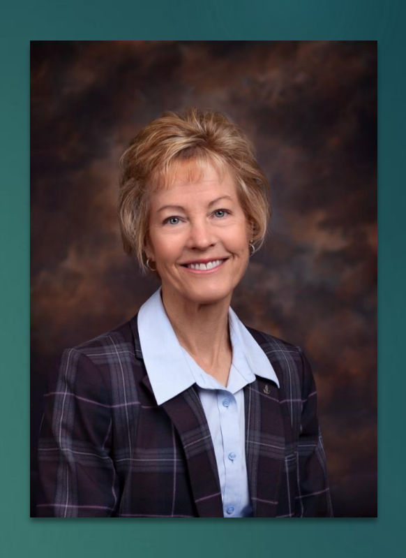
BOARD OF UNION COUNTY COMMISSIONERS 2020